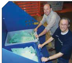
Entrepreneurial ventures continue to provide vocational training for adult residents in settings that match developmental skill sets, on campus and in the local community.