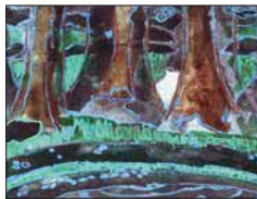
The Center for the Arts unveils Special Arts (S'ART), offering classes in studio arts, music, dance, movement, drama and more to children and teens.