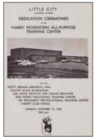
A state-of-the-art training center opens. The center combines a library, auditorium, gymnasium, home economics, pre-vocational and occupational departments, music rooms and speech therapy rooms under one roof.