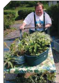
A gardening program is introduced, training residents how to grow and care for plants. Vegetables and plants grown in the greenhouse are sold to public.