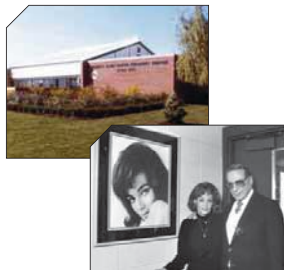
The Karyn Kupcinek Recreation Center launches to provide an environment for adaptive recreational programming and sensory stimulating activities.