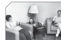
Little City's first Community Integrated Living Arrangement (CILA) home opens, allowing adults to experience independent living in a community setting.