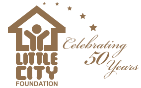
Little City celebrates 50 years of dedication to improvements in the lives of individuals with disabilities.