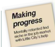
Little City pioneers a vocational service placing teen and adult residents into paying jobs in the community.