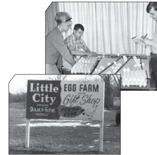
An egg-producing poultry farm is established as a vocational training project. The farm, operated by the children of Little City, sells eggs to raise funds for the organization.