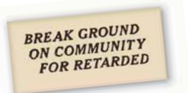
Ground is broken in Palatine off Algonquin Road to construct three residential buildings.

Plan Center for Retarded Children Near Palatine