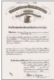
Little City, Inc. files Articles of Incorporation in the state of Illinois on January 28.