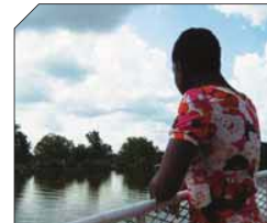
The Children's Residential program launches a Transitional Living Program (TLP) to serve individuals ages 18-21 referred by the Department of Child and Family Services (DCFS).