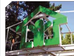
Plans are underway to improve the quality of life on the Palatine campus through expanded recreational options, creative employment opportunities and a therapeutic community with an on-site dental clinic.