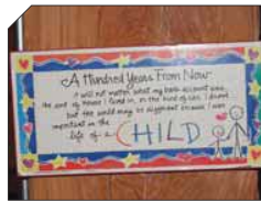
The Special Needs Adoption program opens to place children with disabilities in loving permanent homes.