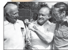
Little City hosts its first golf invitational fundraiser.