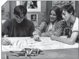
The Studio Arts program begins, allowing participants to explore their own creativity through a variety of artistic media.