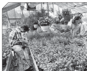
The florarium opens to provide therapy through horticulture to the residents at Little City.