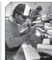
As an extension of earlier vocational training services, the Supported Employment program expands to allow adults to work on campus or at one of more than 70 participating corporations throughout Chicagoland.