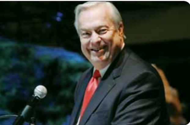
Legendary CBS 2 anchor, Bill Kurtis, commanded the attention of hundreds in the Oceanarium with his presence and renowned talent