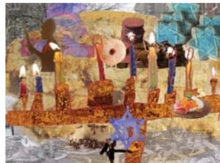
"May your holiday season be bright with joy and rich memories. Happy Hanukkah."