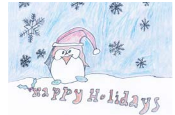
"Wishing you a cool Yule!"