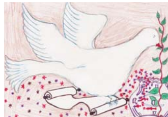
"Wishing you peace, joy and happiness this holiday season."