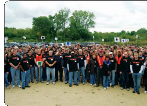
More than 450 volunteers from Discover Financial Services visited Little City's campus for an extreme makeover.

Additional projects included painting a mural and multiple signs, yard work, laying mulch over a mile-and-a-half-long trail, gardening, building picnic tables and benches and painting homes in colors that are therapeutic for the children and adults with disabilities that reside there. In addition to funding all the projects and supplies that were needed for the day, Discover donated a new entrance sign to create more visibility for Little City.