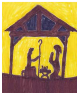
"May the meaning of his birth fill you with peace and love."