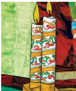
"May the warmth and peace of the holidays be yours today and always."