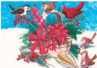
"Gather with friends and family to enjoy the bounties of this holiday season."