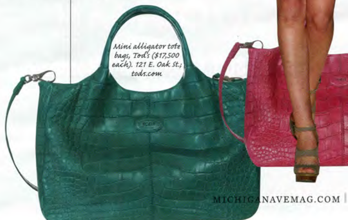
Mini alligator tote bags, Tod's ($17,500 each), 121 E. Oak St.; tods.com