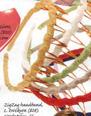
ZigZag headband, L. Erickson ($28). Nordstrom, 55 E. Grand Ave.; nordstrom.com