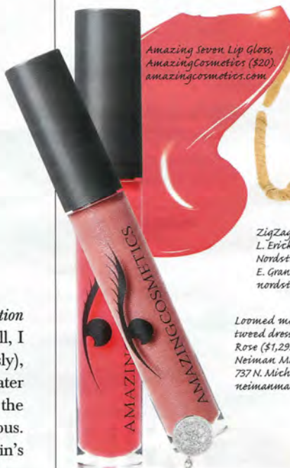
Amazing Seven Lip Gloss, AmazingCosmetics ($20). amazingcosmetics.com